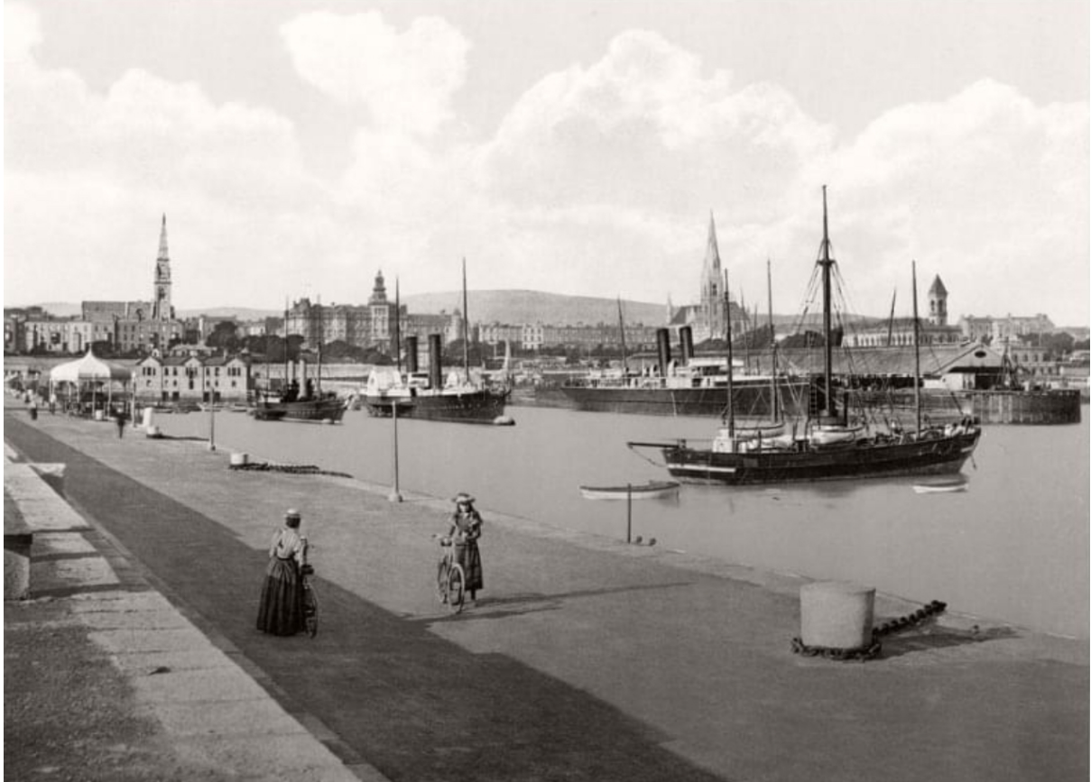
Dún Laoghaire (Kingstown) Harbour. No date but maybe around the turn of the 20th century

No need to book but €5 is payable at the door.