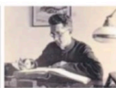
■ Hugh O'Flaherty: a prolific letter writer he is being commemorated with an An Post stamp

Researching my Escape Line novels in London's Imperial War Museum I read a letter written by a British soldier, one of the thousands who liberated Rome, describing the Sistine