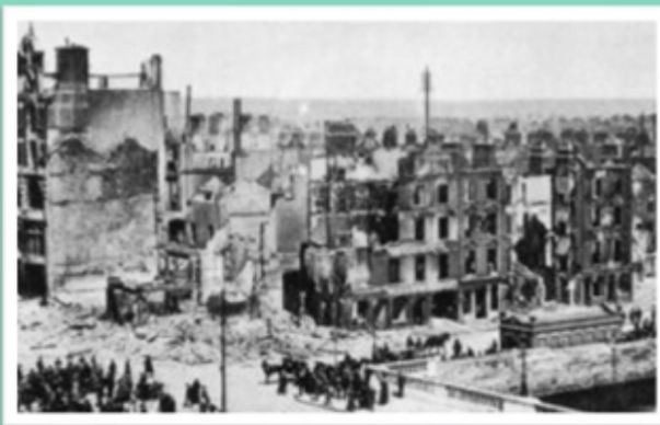
Shops and business premises destroyed on O'Connell Street after the 1916 rebellion.