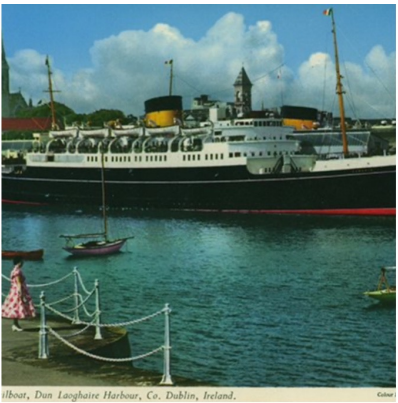
Harbour, Dun Laoghaire Harbour, Co. Dublin, Ireland.