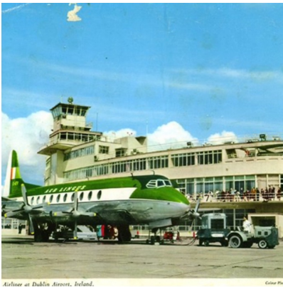
Airline at Dublin Airport, Ireland.