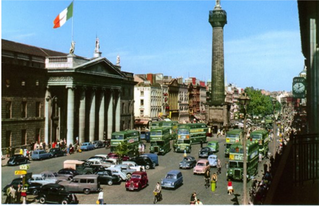
Nelson's Pillar, and the General Post Office, O'Connell Street, Dublin, Ireland.