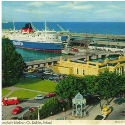
Harbour, Co. Dublin, Ireland.