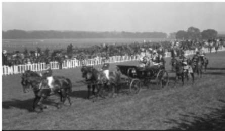
King George V and Queen Mary at Leopardstown July 1911