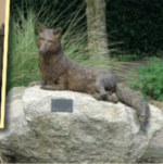
Foxrock Golf Club

Tullow Church > Cooldrinagh > Gortanore > Telephone Box > The Hotel > Racecourse > Foxrock Station > The Gables > Tin Church