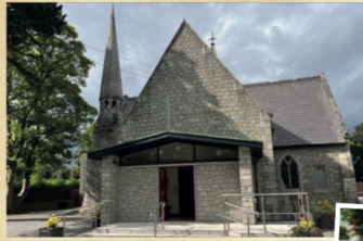
Tullow Church Built in 1864 at a cost of £1,600 (€260,000 today)