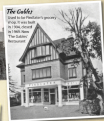
The Gables Used to be Findlater's grocery shop. It was built in 1904, closed in 1989. Now 'The Gables' Restaurant