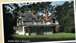
Gortanore Beside Thomas Shop, the garden of Gortanore is where the river (St. Bidu's Stream, also called the Foxrock Stream) which flows through Cabinteely Park rises