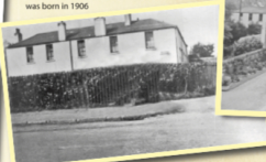
The Hotel Built in 1860, it was originally called the Victoria Hotel. By the 1940s it had become a tenement and was eventually demolished