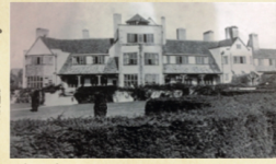
Kilteragh Built in 1906 for Senator Sir Horace Plunkett but was burned down in 1923