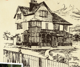
Cooldrinagh On the corner of Brighton Road and Kerrymount Avenue where Nobel Laureate Samuel Beckett was born in 1906